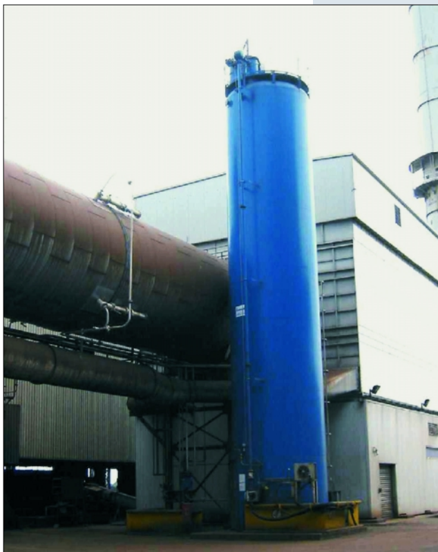
Figure 3. Overall view of the activated lignite dosing system

is separated in the fabric filter together with the filter dust.